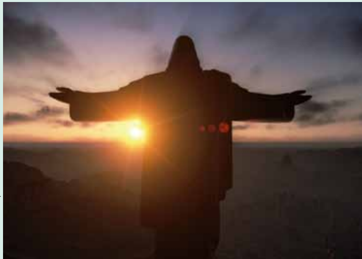
Christ the Redeemer: Rio de Janeiro, Brazil

Furthermore, Evangelicalism is rapidly expanding in many places around the world, especially the global South – in places like Brazil, for example, with a historically Catholic population. Anyone who wants to know about the place of Christianity in Canadian society and in the world at large cannot ignore Evangelical Christianity.